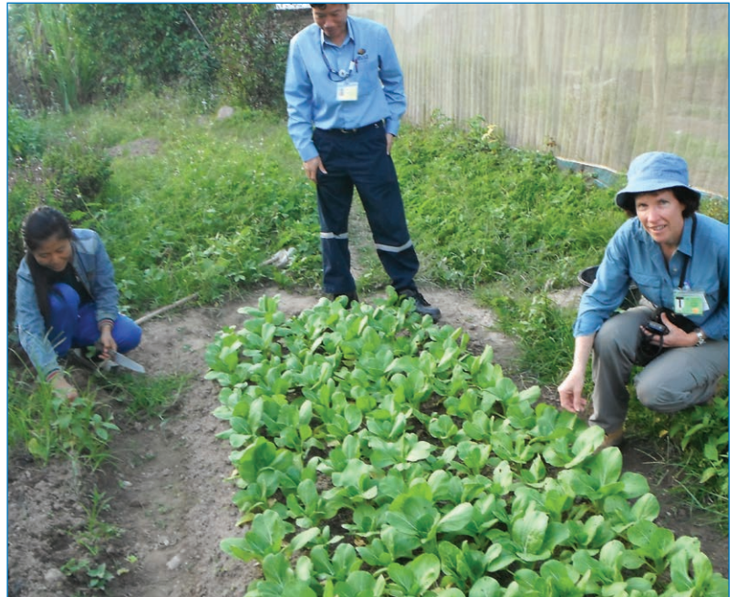
Economic development for mine impacted communities

Appropriate strategies to engage with key stakeholders during the project can then be developed and implemented in collaboration with your staff.