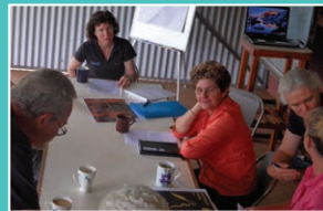
Stakeholder consultation, Australia