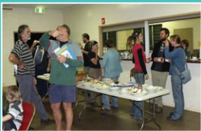
Community engagement, Australia

We have the experience to engage stakeholders who have been alienated by a project and the skills to open up communication pathways to incorporate their concerns and needs into the project. We are able to provide advice on appropriate mechanisms for negotiation and can facilitate the negotiation process in collaboration with our client.