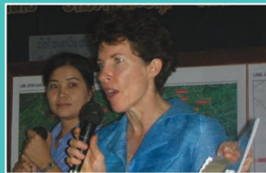
ESIA stakeholder consultation, Lao PDR