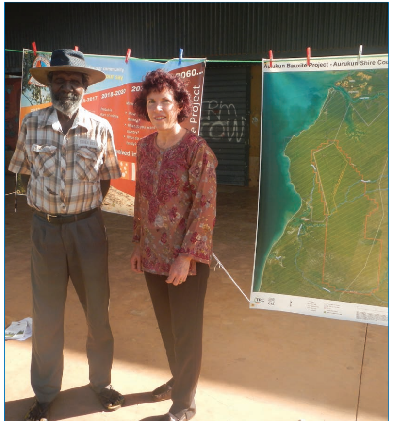
Stakeholder support - planning for mining, Aurukun

We can help your organisation or group to interpret technical reports and government regulations, prepare submissions and develop strategies to maximise the benefits of projects while minimising the impacts on your community and the environment.